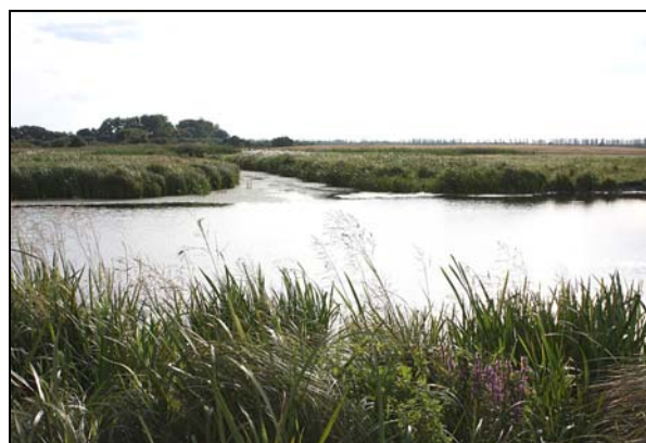
Photo 2. Wetlands in the forest-steppe (the place of two rivers confluence and floodplains) Fot. 2. Tereny wodno-bagienne na obszarze lasostepu (rzeki i terasy zalewowe)

Besides water areas of permanent and temporary water bodies the whole floodplain type of locality should be referred to wetlands as habitats of living organisms, because short-time presence of aquatic medium on the floodplain is enough for the necessary development of many types of both animals and plants (photo 2).