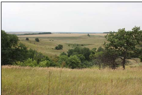
Photo 1. The typical Russian Central Forest-Steppe Fot. 1. Typowy widok Centralnej Strefy Lasostepowej Rosji

forest and steppified formations, caused by the changeable radiative dryness index (photo 1).