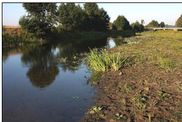
Photo. 3. Drying of the Psyol riverbed

23,9 m 3 /s (66% of the norm) at the check hydrological post (the Seym river, Rylsk), 11,7 m 3 /s (117% of the norm) – at the hydrological observation post of the Svapa river, 3,4 m 3 /s (161% of the norm) – at the hydrological observation post of the Psyol river. At the same time, the level of the Seym river was lower than the norm by 14–17 cm, the Svapa river – by 55 cm, the Psyol river – by 45–50 cm, despite the increased water discharge (photo 3).