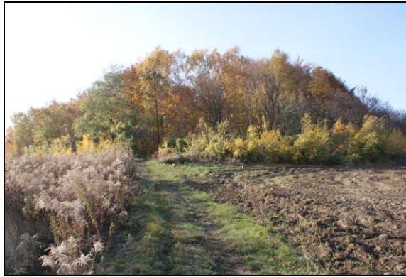
Photo 1. The forest and non-forest community in ecotone zone

re conducted by artificially collapsing the ground (CIEPIELA, 2003). The areas around Mount St. Dorothy still bear numerous traces of mining activity which constitute habitats for many plant vegetation communities (photo 1) and thus increase the biodiversity of this area.