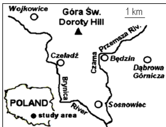
Fig. 1. Location of investigated area Rys. 1. Lokalizacja obszaru badań

The area under study, Mount St. Dorothy and the surrounding protected area, is situated in the northwest of Będzin (Fig. 1). Będzin's geographical coordinates are: 19°03'30"E–19°11'16"E (and 50°22'13"N–50°18'05"N). The average annual temperature in this area in the years 1994–2003 was 8.9°C. The warmest month is July, with an average temperature of 19.3°C, and the coldest are December and January (-1.2°C on average in both months).