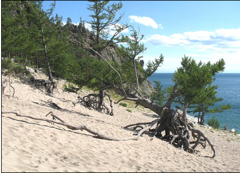
Photo 1. Walking trees ( khodulnye derevya ) in the Sandy (Peschchanaya) Bay, 2008

Fot. 1. Drzewa kroczące w Zatoce Piaszczystej, 2008