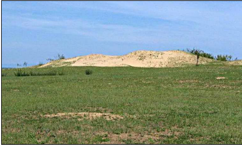
Photo 2. Inkino site: scarp dune against a background of steppe landscape, 2004

Fot. 2. Inkino: wydma krawędziowa na tle krajobrazu stepowego, 2004