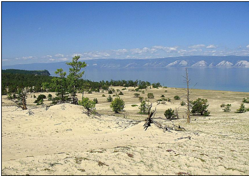
Photo 6. Peschanka site in Olkhon island, general view, 2008

older dunes of different shapes and sizes. The field ends with a clear and thick edge of blown-in sand, which gradually covers up the adjacent taiga (photo 6). A similar morphological picture is visible at the sites of the Bolshoi Khuzhir and Malyi Khuzhir, although they have smaller surface area. In the earlier site sand does not extend to the edge of the taiga so spectacularly, but it does encroach on the road. Intensive deflation of sandy material in the vicinity of the coastal zone caused that – as in the case of the Karga site – we also recently observe the interweaving of small marshy areas with sandy deflationary surfaces and small aeolian accumulation forms.