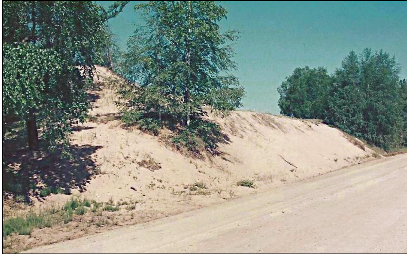
Photo 4. Site Bezmyannaya: dune covering the road, 2002 Fot. 4. Stanowisko Biezymian- naja: wydma zasypująca dro- gę, 2002 Фот. 4. Безымянная: дюна на- ступающая на дорогу, 2002

forested) by the already mentioned increase in the level of Lake Baikal, blown away dunes are separated by numerous marshy depressions, which makes them less able to move (photo 5). It should be noted that the location of the dunes refers to the presence of a number of fan-arranged sandy lake ramparts at the Barguzin Bay, and contemporary activity of sands results from undercutting the shore by storm waves and