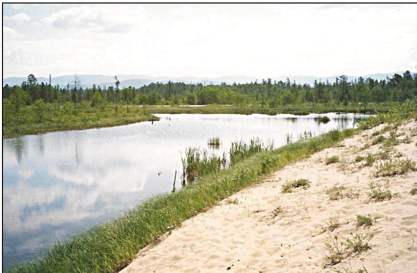
Photo 3. Dunes and the swamp in Bezmyannaya site, 2001

chanoye east of the coastline, is intensely blown and blown away, resulting in a "spectacular" and complex deflation relief. It is a little less complex in Bezmyannaya. What is observed in the Peschanoye site is constant burying the edge of the taiga by the wandering sand; in Bezmyannaya some dunes encroach on the asphalt road, while the others on the local marshes (photos 3 and 4).