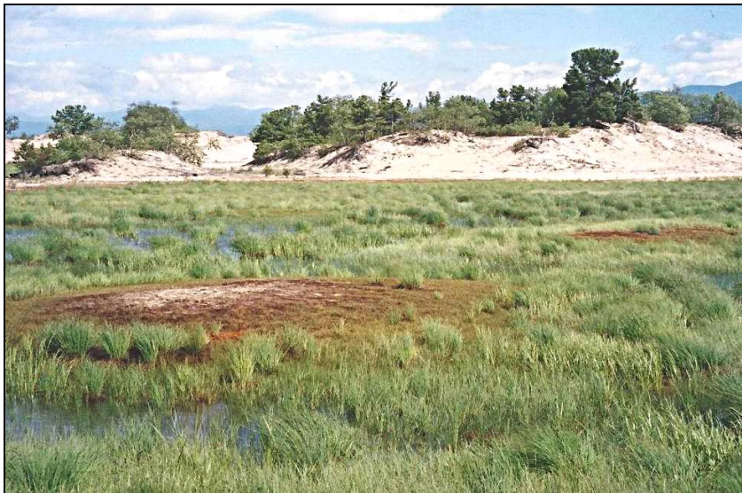
Photo 5. Site Karga: blown-out dunes against a background of boggy areas, 2001 Fot. 5. Stanowisko Karga: roz- wiewane wydmy na tle obsza- rów zabagnionych, 2001 Фот. 5. Карга: развеваемые дюны на фоне заболочен- ных территорий, 2001

On the south-east shore of the Chivyrkuy Bay there is another area of blown sand (fig. 1-I). It is small and does not stand out with anything special with respect to its morphological picture