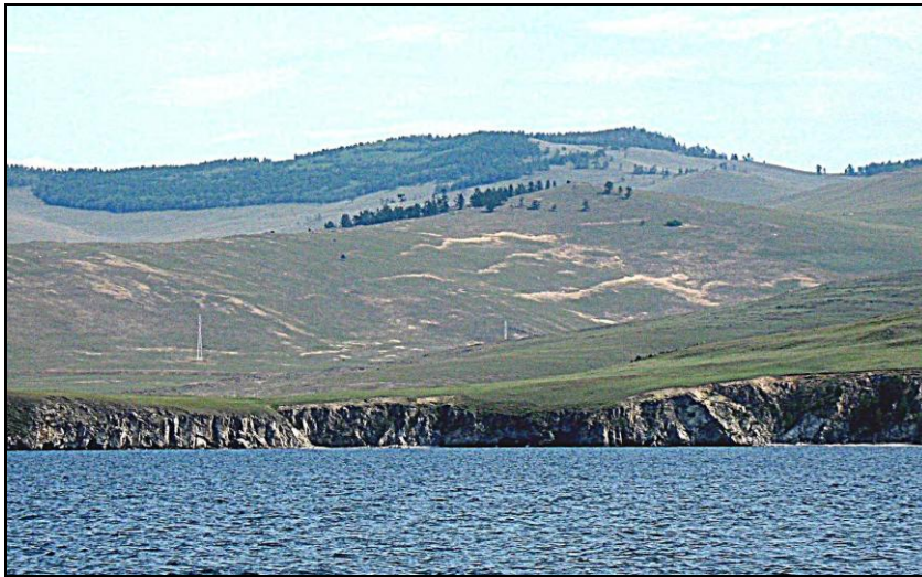
Photo 7. Site Yalga: the view from the deck of boat, 2008

merous deflation basins with accompanying miniature accumulation covers composed of coarse and very coarse material.